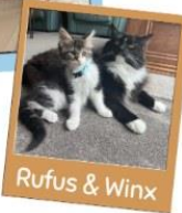
Rufus & Winx