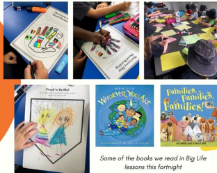
Some of the books we read in Big Life lessons this fortnight

Lots of students also enjoyed origami club at lunch time!